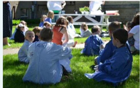
Last day of Sunday School May 22nd

On May 22nd EKLK joined the Family Focus Group (families from area churches) at Camrock park and Rockdale to plant flowers and clean the park.