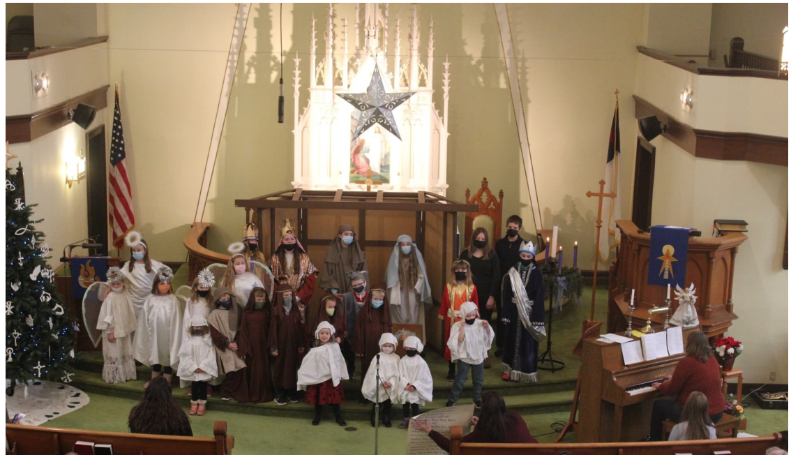
Sunday School Christmas Program 2021 December 19th

Remember to like the videos and subscribe to the channel! https:// www.youtube.com/channel/ UChUv6MDQV54yCWz6oIGWezw FACEBOOK PAGE – Please "Like" us on East Koshkonong Lutheran Church Facebook!